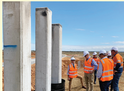
Deputy PM Michael McCormack and I inspected pillars on the Port Wakefield overpass recently. The $124m project will fix traffic problems at "crash corner" and unblock holiday traffic jams.

Ministerial visits are always important and none more so than one from the Prime Minister Scott Morrison. As this issue goes to print, I am expecting the PM in the electorate when we visit the SA Autumn Garden Festival in Clare in mid-April. Following this we will attend an event in Burra. It will be a great opportunity for community members to meet the PM and get in his ear. In February I also hosted Regional Health, Communications and Local Government Minister Mark Coulton for two fast-moving