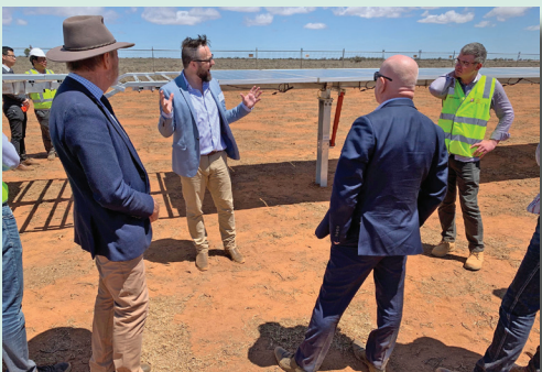
Rowan on a site inspection for GFG Alliance's proposed solar farm at Whyalla. CEO of GFG Alliance Sanjeev Gupta is intent on generating enough renewable energy for his total Whyalla requirements to reduce operating costs.

Australia has total emissions of 540m tonne. China's annual total is 10,000m tonne increasing each year by 260m. Clearly world-wide reductions can only be achieved by international agreement and if signatories actually meet their commitments as Australia does. The Australian Government is working to reduce our emissions, but not by exporting our jobs to other countries lacking the same commitment. A new agreement with NSW will inject another 70 petajoules of gas into our network, assisting energy transition and reducing electricity prices. Our commitments to Snowy 2.0, the HumeLink connector, Tasmania's "Battery of the Nation" and Marinus Link, pumped hydro projects across the nation and battery technologies will all reduce emissions while keeping Australians at work. By comparison the Labor Party has committed to "zero emissions by 2050" and yet have absolutely no idea on how to reach this target, simply hoping something will come along. Misleading the people in this way is a hoax.