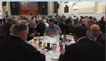
A very successful lunch was held to commemorate 100 years of the RSL in Eudunda and to celebrate the commitment from the small districts surrounding Eudunda.