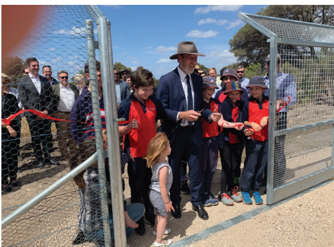
The Great Southern Ark project on southern Yorke Peninsula is enabling intensive feral pest control measures to protect native species and allowing for the reintroduction of species lost in the past. Supported by a $2.6m grant through the National Landcare Program, Rowan was very pleased to open the 25km of vermin-proof fence. It is worth noting feral cats kill 2000 native animals a minute throughout Australia.