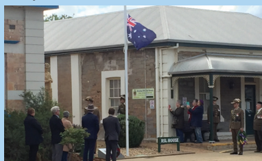
A lovely ceremony in misty rain was held to commemorate Riverton's RSL centenary. The RSL sub-branch held a rededication service for the war memorial and unveiling of the new honour roll.

In the first years following the conclusion of the Great War in 1918 and as our troops returned to Australia, hundreds of RSL sub-branches were founded across the nation. Through the last eighteen months they have been celebrating 100 th birthdays and while I haven't been able to get to every commemorative event in the electorate, I have been pleased to be able to support the Riverton, Crystal Brook, Robertstown, Jamestown and Eudunda sub-branches. The continued importance of the RSL is evident as we see local sub-branches evolve and provide much needed support to service personnel returning from recent deployments in places like Afghanistan and Iraq. They are also the "keepers of the legend" and have a huge role in teaching new generations our history and of our indebtedness to those who have served.