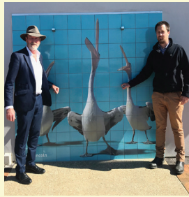
Port Lincoln's fabulous pelican art on the showers near the town jetty was supported by the Stronger Communities Program.