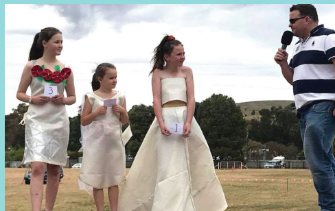
Fashions from wool packs was a feature of the Burra Show with some innovative designs modelled by enthusiastic entrants. SAFM's Cosi was in town to commentate various events.