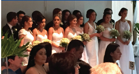
The annual Port Pirie Blessing of the Fleet Deb Ball was again a wonderful success. The night is enjoyed by family and friends.