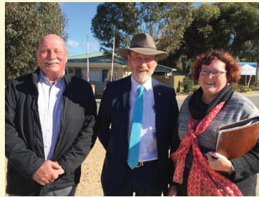
Ardrossan Caravan Park was provided with $75k to build two new luxury cabins under the BBRF which has delivered more than $40m to Grey over five years.

Eleven communities received support from the Armistice Centenary Grants Program - Alford, Burra, Bute, Craddock, Gladstone, Laura, Port Lincoln, Port Vincent, Quorn, Stansbury and Wudinna.