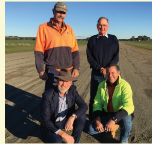
The Clare Valley Aerodrome received $469k to seal the strip from the Building Better Regions Fund.