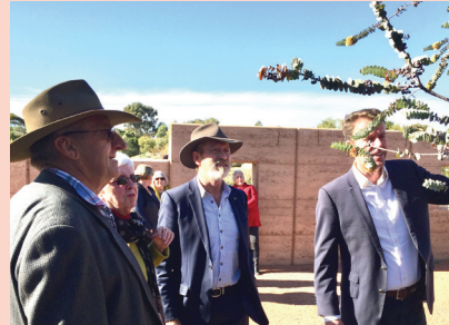
Port Augusta... With then Social Services Minister Dan Tehan in town to address a meeting of volunteers at the magnificent Arid Lands Botanic Gardens.