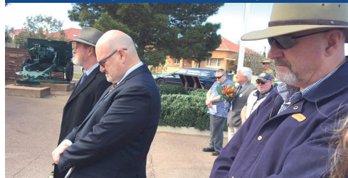
Vietnam Veterans' Day is increasingly important for Australians to remember the military service of Vietnam veterans. It is a time to recognise and atone for the way returning servicemen were treated at the time.