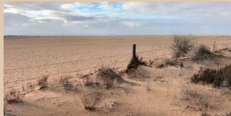
Arno Bay...Thousands of tonnes of valuable top-soil have drifted out of the paddock and on to the road. Recently announced assistance to councils will help return the soil to the paddocks and not place this cost on farmers.