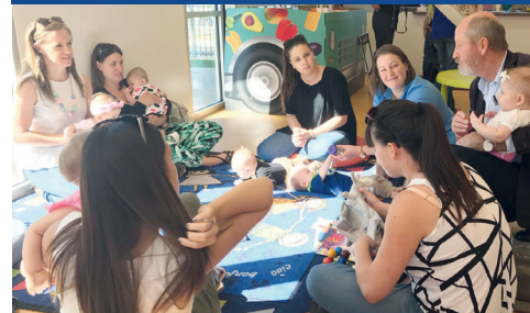
Wonderful to see the involved parents at Port Pirie West Children's centre giving their children the best start in life. I enjoyed meeting the enthusiastic staff at the centre on Harmony Day.