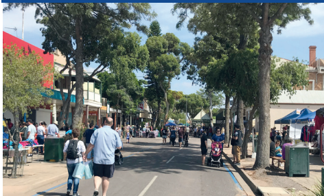
Port Augusta - The large street market is always a good time to buy gifts and catch up with people; the weather was glorious. With more than 80 stallholders offering a large variety of products, live music and plenty to eat, the markets are a huge success and a great day out.

Port Pirie 104 Ellen Street Tel: 8633 1744